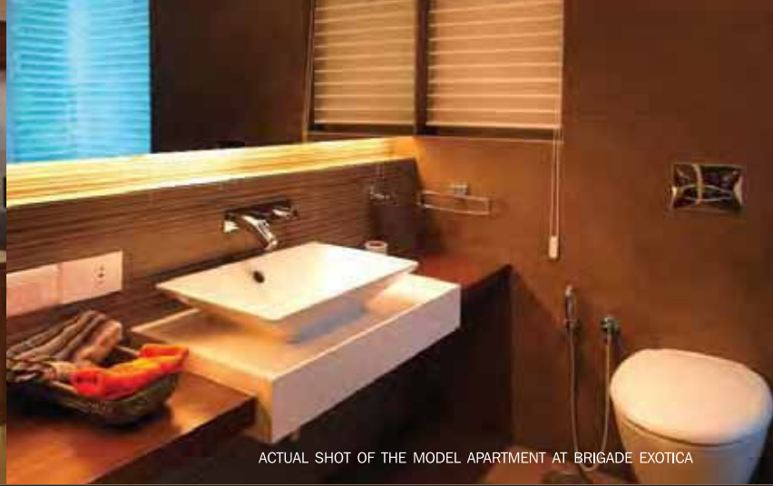
ACTUAL SHOT OF THE MODEL APARTMENT AT BRIGADE EXOTICA